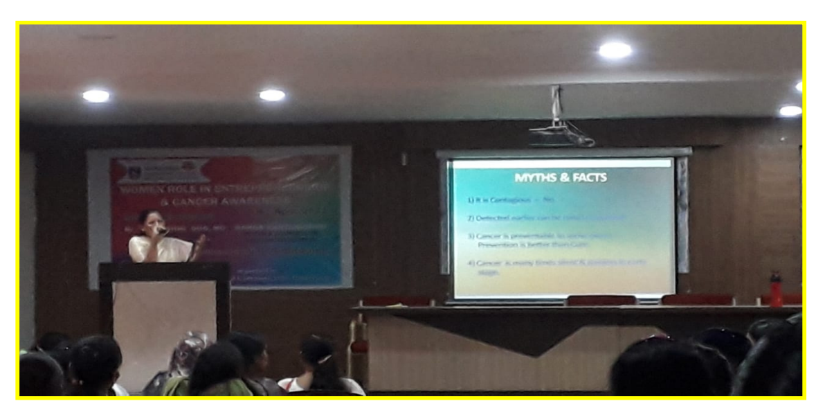
PPT presentation on health awareness