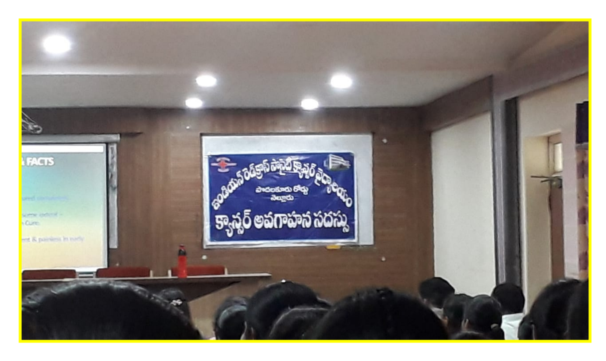
Awareness on cancer